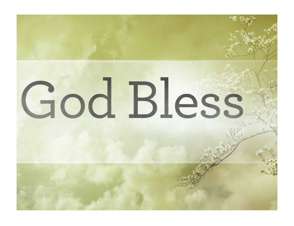
Mt. Olive Baptist Church April 2024