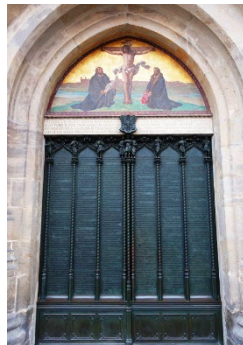
Photo: The Church door in Wittenberg Germany where Martin Luther posted his paper.

I have been really encouraged by the development of the Sanford Youth Network. A lot of Youth groups are collaborating together within the association. I hope that we can participate in some group worship soon.