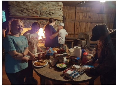
Camping fun at the church farm!