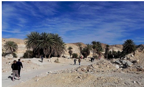
Legendary site of Elim, where the Israelites stopped in the wilderness.

Hey guys! So glad it's the summer. Hope we get to go outside more and enjoy the beach. I am so excited for camp the first week of July! As we spend more time outside, we have more opportunities to get in nature. Reading the Bible alone with God is essential to the Christian Life, but it is so much sweeter when we can also do so in nature. Look for opportunities to do this! When we spend time with God it is like an oasis in the desert.